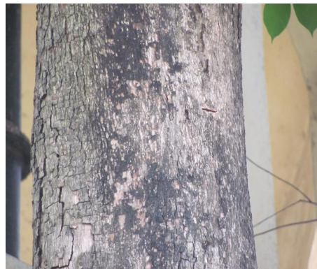
Fig 4: Jamun bark