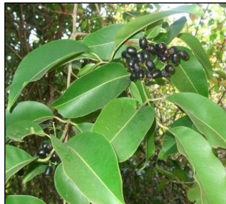
Fig 5: Jamun leaves