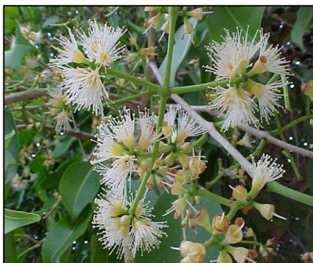
Fig 3: Jamun flowers