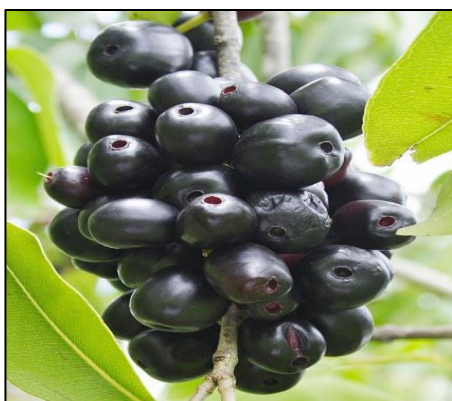
Fig 2: Ripe Jamun fruits