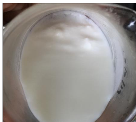
Fig 1: Yogurt with Lactococcus lactis cremoris fortified with Polyphenols of Fenugreek Seeds

L. lactis cremoris isolated from homemade yogurt was used as a starter culture prepare PFFS yogurt. Addition of starter culture helped to obtain a presumably characteristic yogurt. The phenol in the extract was added to influence the aroma and flavor of the yogurt. (Fig.1). The antioxidant activity of yogurt, also, maybe attributed to phenol content of fenugreek seeds.