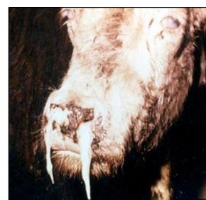
Fig 1: Mucopurulent nasal discharge

Typical signs of head and eye form are opacity of the cornea, with a narrow grey ring at the corneo-scleral junction. The characteristics of this form include high fever (40–41 °C), mucopurulent nasal discharge, dyspnea due to nasal cavity obstruction, lymphadenopathy and blepharospasm [18]. The muzzle and nares are usually encrusted and the superficial lymph nodes are often markedly enlarged in cattle.