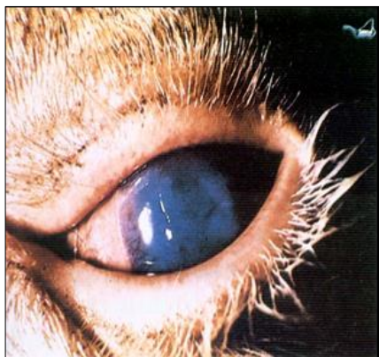
Fig 2: Corneal opacity, Conjunctivitis and reddening of eye- lids