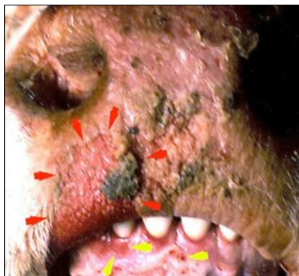
Fig 3: Focal ulceration of oral mucosa and sloughing of epidermis on muzzle