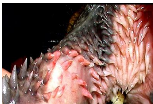
Fig 4: Inflamed, discoloured and eroded oral papillae

The alimentary form has several of typical symptoms of head and eye form except that there are only minor eye changes and pronounced diarrhea [15] . The oral mucosa is often hyperemic and may contain multifocal or diffuse areas of necrosis. Erosions may be found at the tips of the buccal papillae.