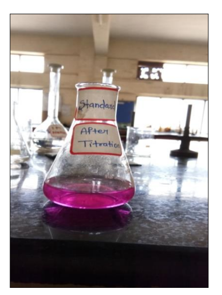
Fig 1: Color change of standard phenolphthalein indicator.

There is strong acid (HCL) and strong base (NaOH) type titrations were performed. 10 ml of titrant was titrated against titrate with drops of curcumin extract and ashwagandha extract which was used as indicator. Color change for each indicator is listed below. Color change of each indicator was compared with color change of phenolphthalein indicator. Each titration was repeated three times to check accuracy of experiment.