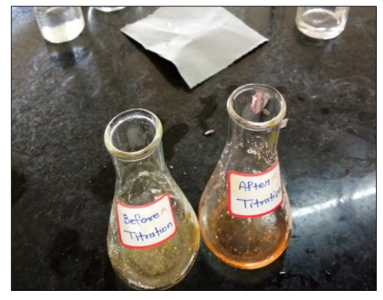
Fig 3: Color change of ashwagandha extract yellow to orange after titration.