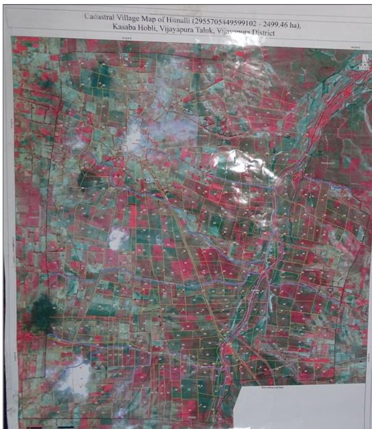
Fig 2: Cadastral map of Hittnalli village