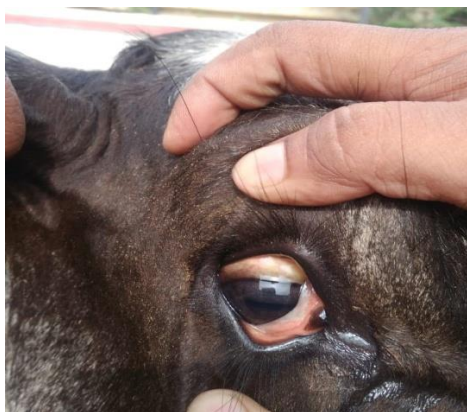
Fig 1: Showing icteric eyes and lacrimation