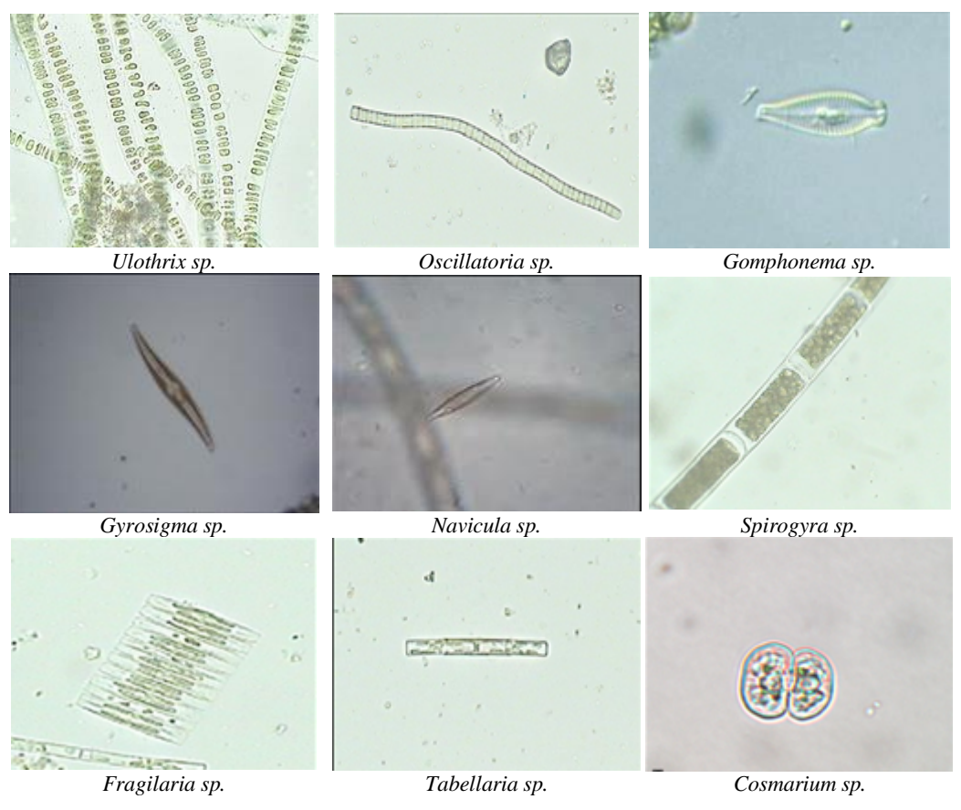
Fig 2: Commonly recorded Phytoplankton species at Lake Nainital

sp., Chlamydomonas sp., Oedogonium sp. and Ulothrix sp. This finding is similar to the findings in which a total of 25 genera of phytoplankton were recorded, belonging to three classes Bacillariophyceae (13 genera), Chlorophyceae (8 genera) and Cyanophyceae (4 genera) at Nainital lake from 2007 to 2009 (Negi and Rajput, 2015) <sup>[2]</sup>. Phytoplankton community structure and species diversity of Nangal wetland, Punjab, India shows that in fresh water ecosystems the Bacillariophyceae, Chlorophyceae and Cyanophyceae make up the three major groups of algae (Brraich and Kaur, 2015) <sup>[19]</sup>. The percentage contribution of different groups of phytoplankton in south coast of India and observed were observed as Bacillariophyceae > Chlorophyceae > Cyanophyceae > Euglenophyceae (Ajithamol et al. , 2014)<sup>[20]</sup>. Some commonly recorded phytoplankton species of Lake Nainital are presented in Figure-2.