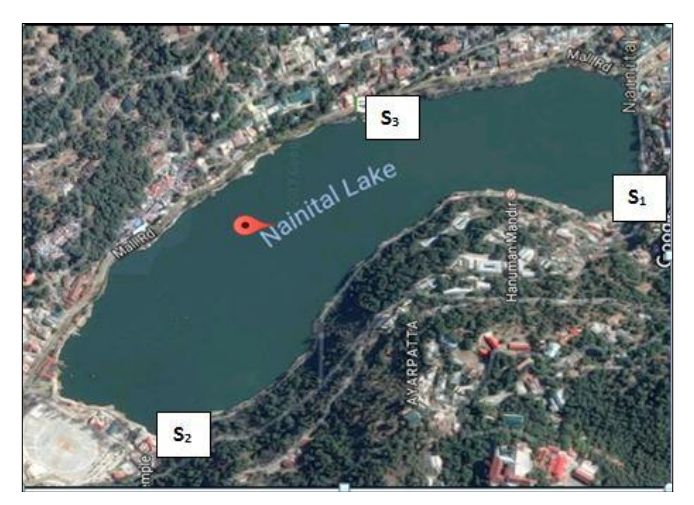
Fig 1: Location of sampling stations at Lake Nainital of India

Three sampling stations S_1 , S_2 and S_3 were selected at different locations of lake (presented in Figure-1) depending on various anthropogenic influences. S_1 was near aerator plant, which was operated to improve the dissolved oxygen content of the lake, S_2 was near Naina Devi Temple, where drainage of temple was flushed into the water and S_3 was near Boating site, where there was lot of human intervention by activities of tourists.