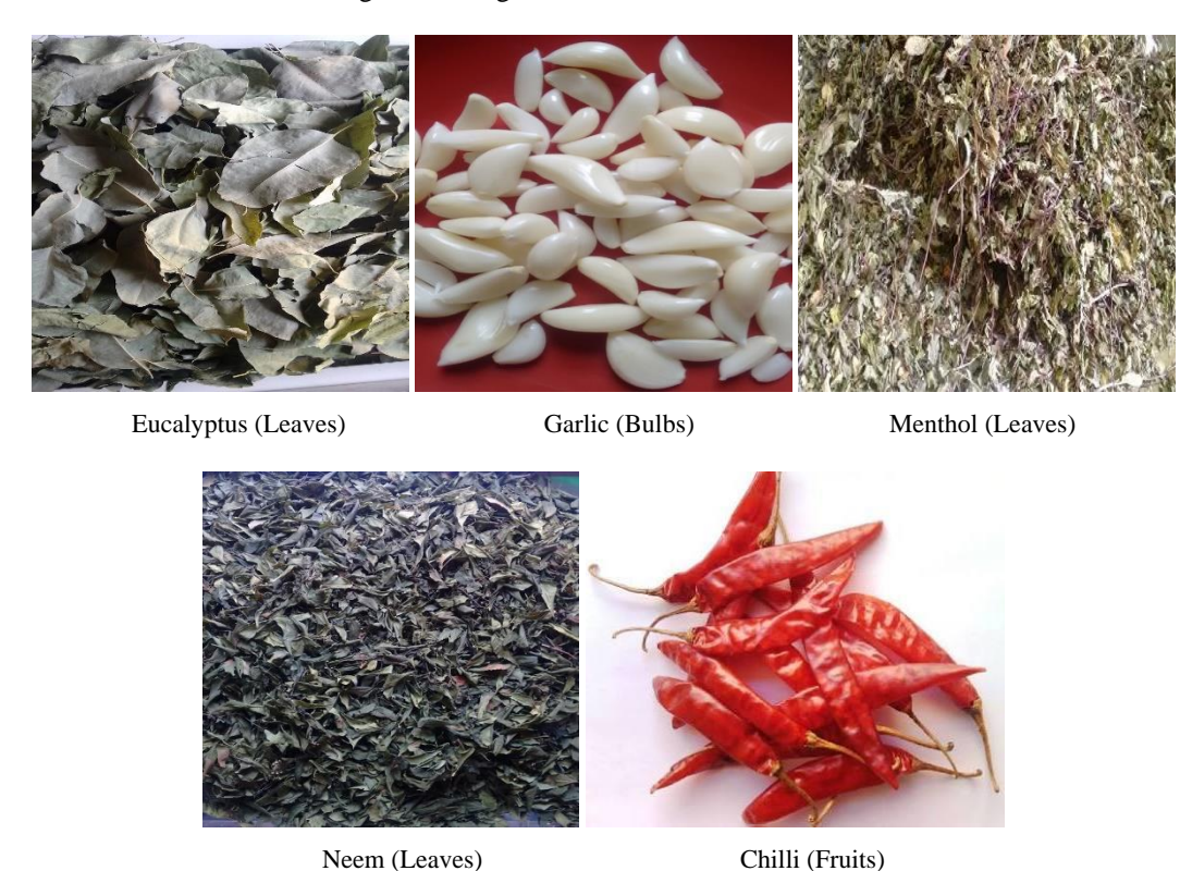
Fig 1: Collected Sample of plants used as extracts