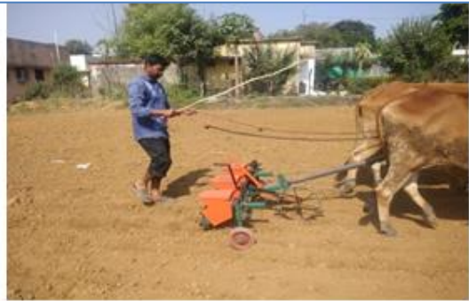
Fig 3: View of field testing of the planter