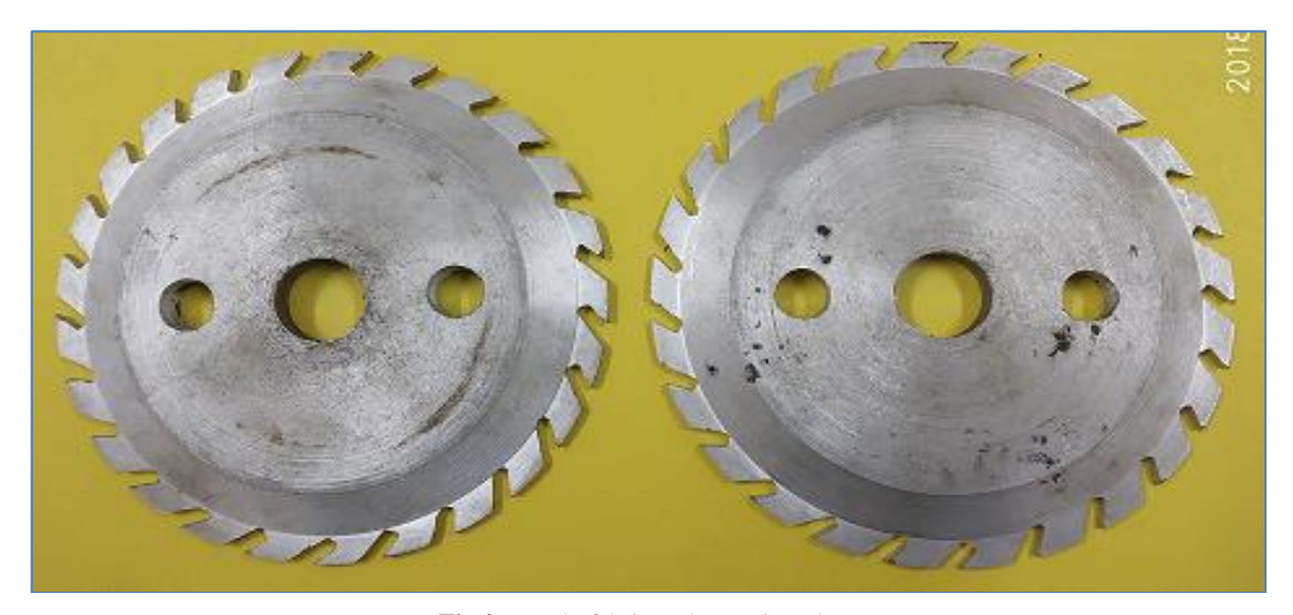
Fig 2: Newly fabricated metering plate