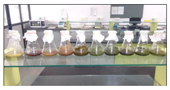
Plate 1: Methanolic extract of different medicinal plant sample