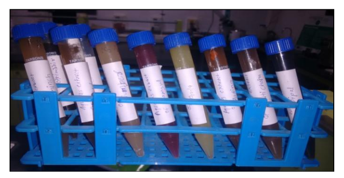
Plate 1: Aqueous extract of different medicinal plants