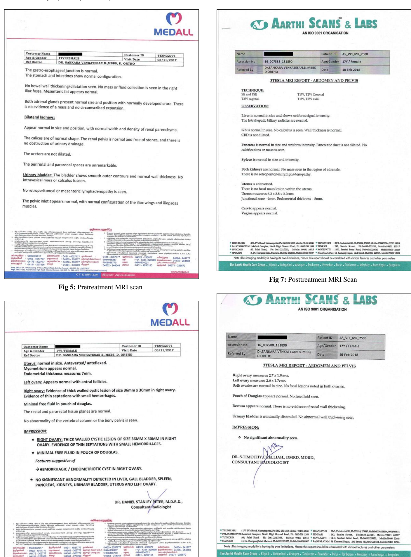
Fig 8: Post treatment MRI scan