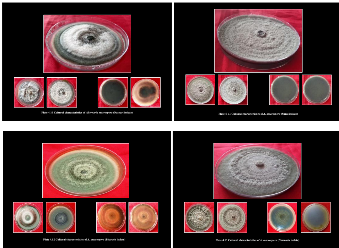
Plate 2: Cultural characteristics of A. macrospora

++++ Excellent sporulation, +++ Good sporulation, ++ Moderate sporulation, + Poor sporulation