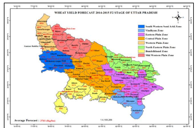
Fig1: District level simulated wheat yield (F2) Predication for Uttar Pradesh, India.

The simulated wheat yield predication along with observed yield in 2011-12, 2012-13 and 2013-14 for various stations representing different agroclimatic zones. The validation results indicate that the hindcast wheat yields for most of the districts are within the acceptable error limit (±10%) in all the years of validation; however, prediction was marginally higher in the year 2011-12 for Central Plain zone (Kanpur), 2012-13 for Buldelkhand zone (Jhansi) and 2013-14 for Eastern Plain zone (Faizabad). Yield forecast validation is highest correlation (R 2 =0.98 and RMSE value 384, 372, 367, 355, 271, 269 and 196 kg ha -1 respectively) for Kanpur, Jhansi, Lucknow, Varanasi, Baharich, Modipuram and Faizabad, followed by Allahabad (R 2 =0.93 and RMSE 110 kg ha -1 ).